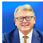
Nicolas Schmit European Commissioner for Jobs and Social Rights

Effects of the pandemic in accelerating digital transformation and accentuating skills gaps